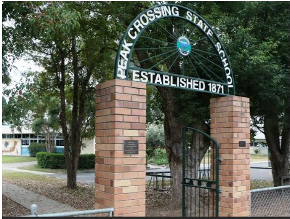
Acknowledgement of Country

Staff and students of Peak Crossing State School acknowledge that their school stands on Ugarupul Country and would like to acknowledge the Ugarupul peoples who have cared for this land for many years.